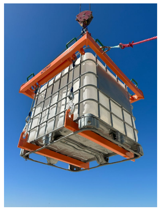
IBC "Tote" Mode