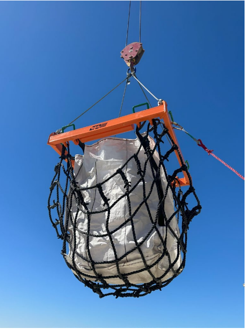
FIBC Mode Dropped Object Protection