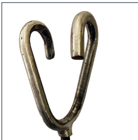
Lap Link Tool