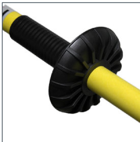
Large Protective Grip